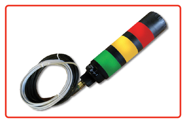
Light Tower w/ Audio

FutureWorks loved the Light Tower w/Audio. The Light Tower w/Audio was designed to connect to any Room Alert monitor and enhance the alerting capabilities of any Room Alert, Axis camera or other application on the network. Light Tower w/Audio provides visual and audible alerting when an issue or event occurs and this feature was a huge selling point for FutureWorks.